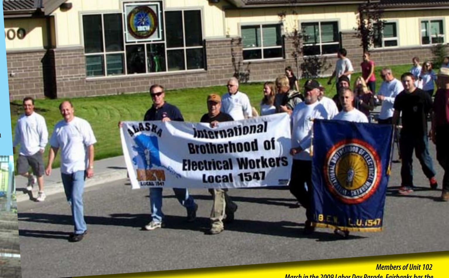
Members of Unit 102 March in the 2009 Labor Day Parade. Fairbanks has the largest Labor Day Parade in the State of Alaska.