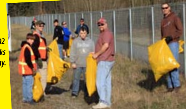
Members of Unit 102 help out on Fairbanks Clean Up Day.

The Unit 102 Summer picnic will be held Sunday, June 27th from noon until 5 p.m. at the Kornfiend Training Center in Fairbanks. For more information, call the Training Center at (907)479-4449.